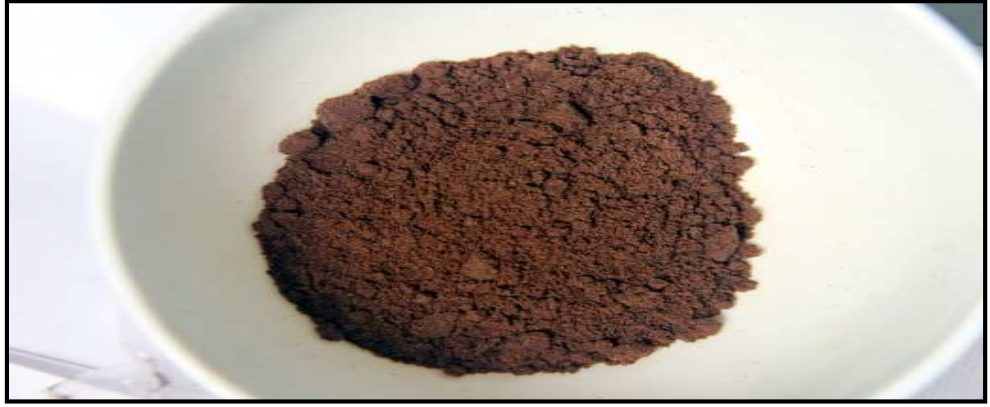
Figure No.1: Final formulation of vaivilangam choornam Available online: www.uptodateresearchpublication.com October - December

One way ANOVA followed by Dunnet's test. Values are mean \pm S.E.M. n = 6 in each group.